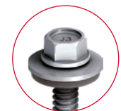
Self-drilling screw JF6-2-5.5

A4 stainless steel available upon request