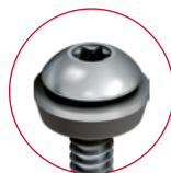
Self-drilling screw JT3-FR-2-5.5

A4 stainless steel available upon request